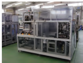
OCA attaching equipment