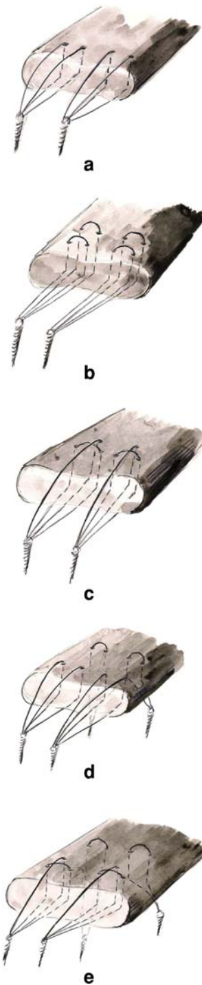
Fig. 1 Schematic line drawing of the used repair techniques. a One line of two double-loaded suture anchors using simple stitches (SRA-s). b One line of two double-loaded suture anchors using horizontal mattress stitches (SRA-m). c One line of two double-loaded suture anchors using arthroscopic Mason-Allen stitches (SRA-ama). d Two lines with a total of four suture anchors using a combination of simple (lateral/double-loaded) and horizontal mattress stitches (medial/single-loaded) (DRA-sm). e Two lines with a total of four suture anchors using a combination of arthroscopic Mason-Allen (lateral/double-loaded) and horizontal mattress stitches (medial/single-loaded) (DRA-amam)