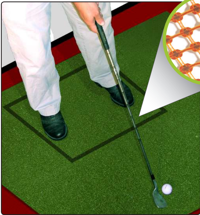
Golf swing assessment sensor element

Professional golfers and instructors know that the distribution of weight and balance are key components of power in a swing. They realize that speed and power come from the lower body and not just the hands and the arms, but they lacked one vital tool to help them take action to shift their body weight. Now the balance of a golfer's feet as it goes through a swing can be revealed and quantified thanks to the Tactilus®. This technology gives suppliers of sports motion analysis systems, golf club manufacturers, instructors and others in the industry the tools they need to easily analyze these important swing dynamics.