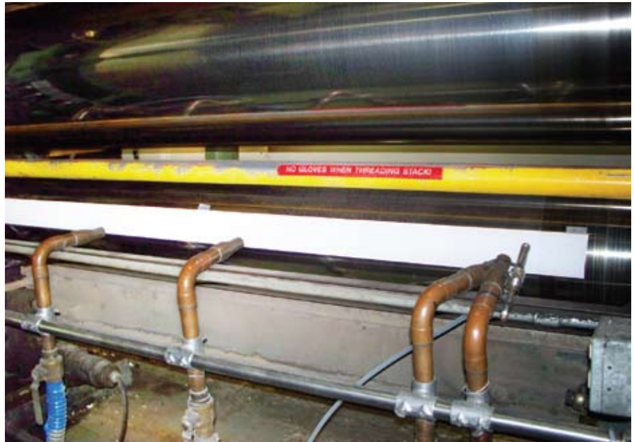
Pressurex® is placed on the roller at Mohawk Fine Papers before closing the nip.

When placed between contacting rollers, the sensor film instantaneously and permanently changes colour directly proportional to the actual pressure