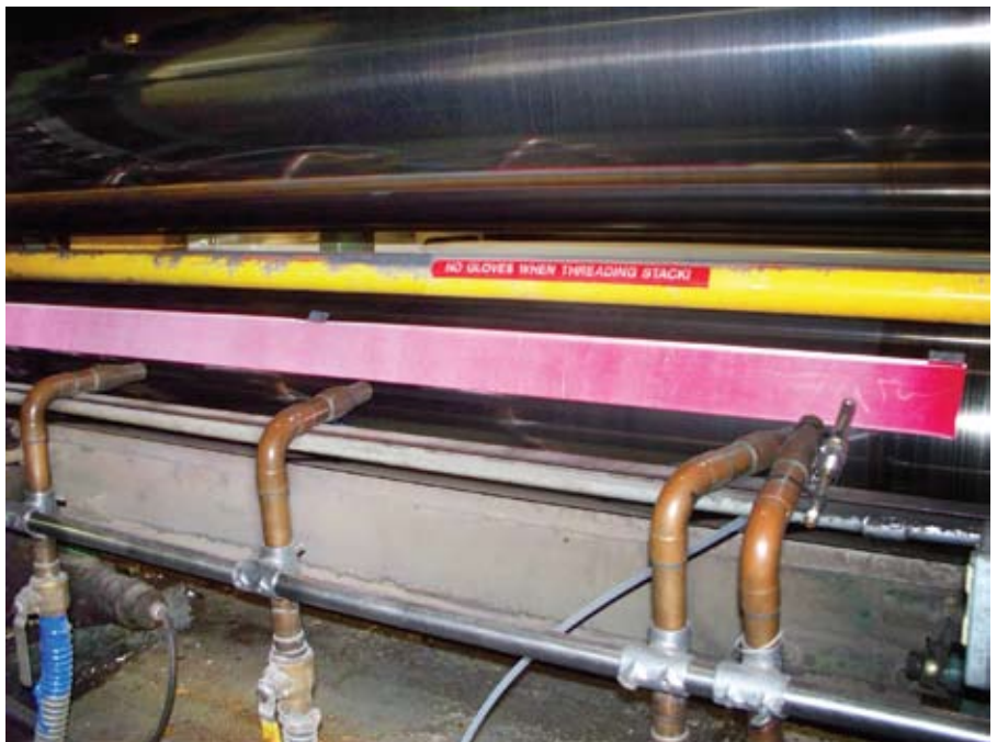
Pressurex® reveals variations in nip contact pressure which can be easily quantified.