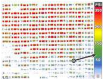
Figure 4: Pressurex film revealed the uneven distribution of pressure across the press plates.

After the pressing operation, when we examined Pressurex, the film had changed different intensities of color, with the color change directly proportional to the actual pressure applied. SB Electronics was able to determine the precise pressure magnitude by comparing the color intensity to a color correlation chart (conceptually similar to interpreting Ultras paper). We could visually inspect Pressurex and prove the press plates weren't flat and were causing uneven pressure distribution.