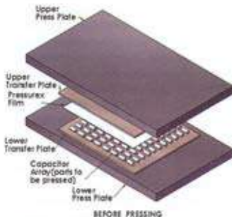
Figure 2: Before Pressing

We inserted a sheet of Pressurex on top of the capacitors and between the press plates during a product run.