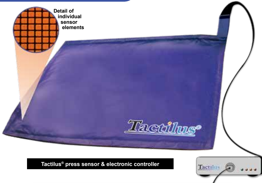
Tactilus® press sensor & electronic controller