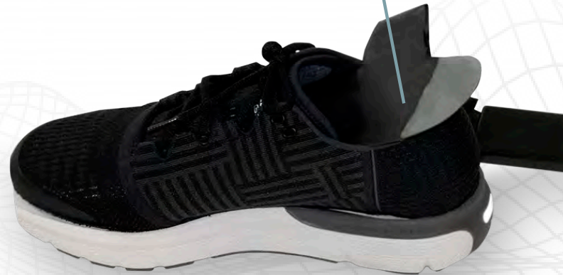
Foot insole sensor inserted into a shoe