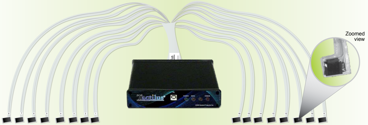
The Tactilus Free Form® sensor system