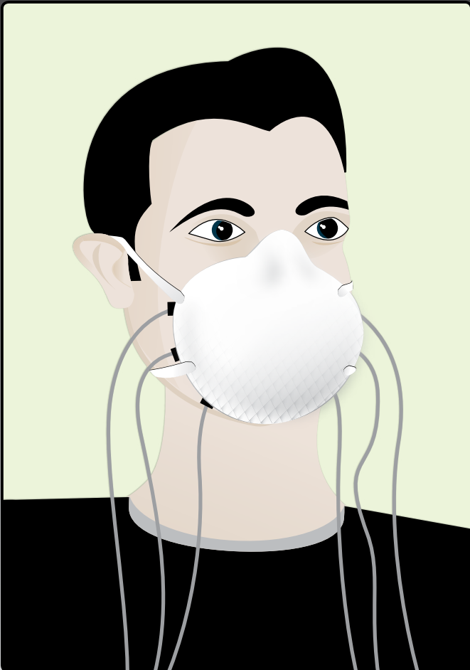
Example of Tactilus Free Form® being used for face mask sealing pressure measurement