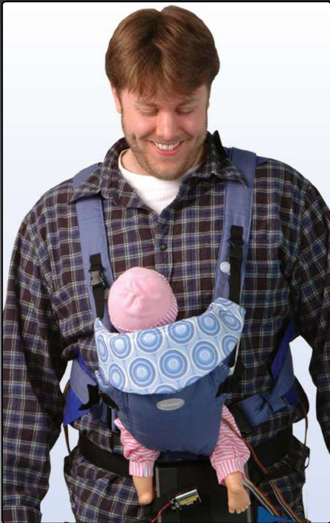
Tactilus Free Form® sensor system in action