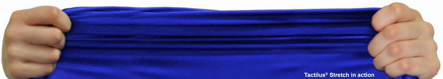
Tactilus® Stretch in action