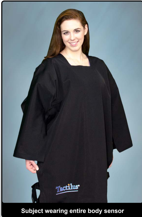
Subject wearing entire body sensor

The Tactilus® Human Body Interface sensor system is designed to allow the user to collect pressure magnitude and distribution data from across the surface of the human body.