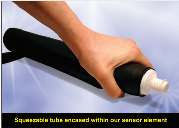
Squeezable tube encased within our sensor element