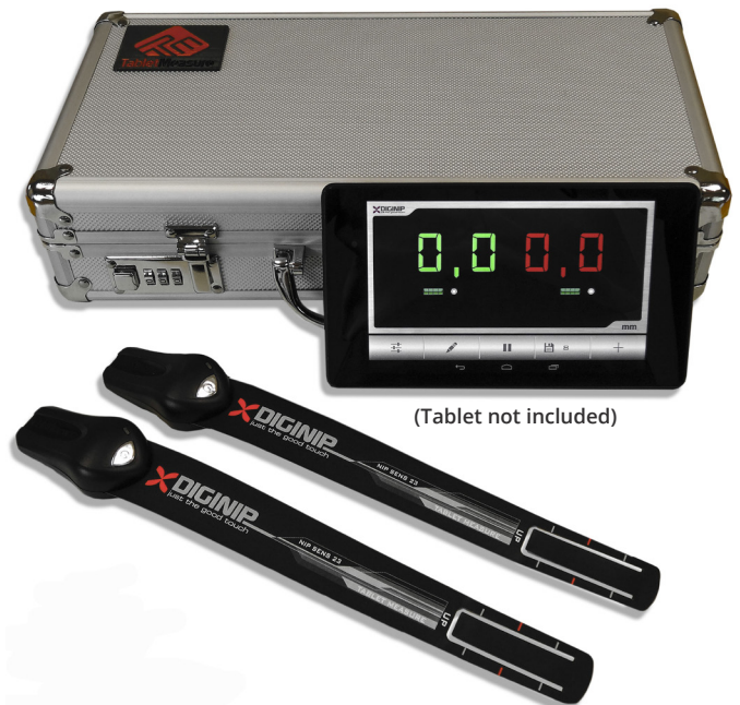
Handheld DigiNip 2 ® device and carrying case

No more time consuming and inaccurate nip measurements with carbon paper. Now nip readings can be determined instantaneously and adjustments made while the sensor is between your rolls! DigiNip 2 ® is also economical. The replaceable sensor elements that connect into the DigiNip 2 ® device are built to last, and will provide thousands of readings.