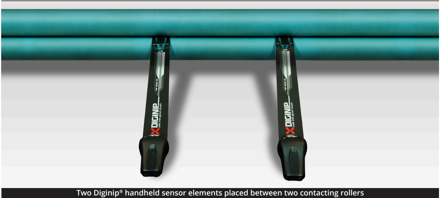
Two Diginip ® handheld sensor elements placed between two contacting rollers

Never before has it been this easy to measure your roller alignment!