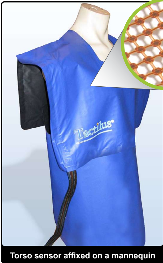
Torso sensor affixed on a mannequin

The Tactilus® Human Body Interface sensor system is designed to allow the user to collect pressure magnitude and distribution data from across the surface of the human body.